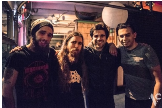
Experiment 34 at "Charismatic 2.0" EP release party Jan. 14 at Asbury Park Yacht Club

Asbury Park Music Award nominee to participate in Millennium Music Conference & Showcase before heading to Texas & Nashville; offers free single to new YouTube subscribers